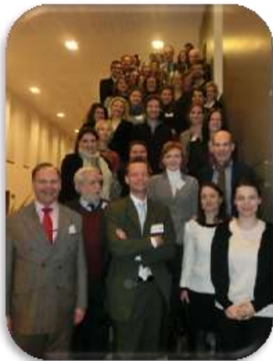
YEA Expert – Annual Training Seminar

Topics of enquiries typically handled by Your Europe advice are social security (questions about pension rights, family benefits, unemployment benefits), vehicles (registering or buying a car in another EU country, driving licences), visas (Schengen and other visas for people from outside the EU), residence (the right to live in another EU country, and what formalities are involved), work (recognition of professional qualifications and diplomas, people sent to work abroad), and taxes (finding out in which country you have to pay taxes).